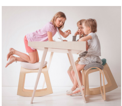
Children embrace the smart sitting naturally