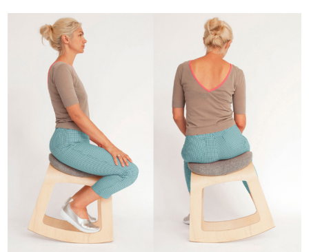
Two interchangeable positions for sitting and exercise - saddle and bench