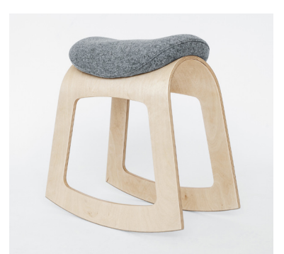
Materials: plywood, PU foam,

* LINK TO ARTICLE: If You're Sitting Down, Don't Sit Still, New Research Suggests