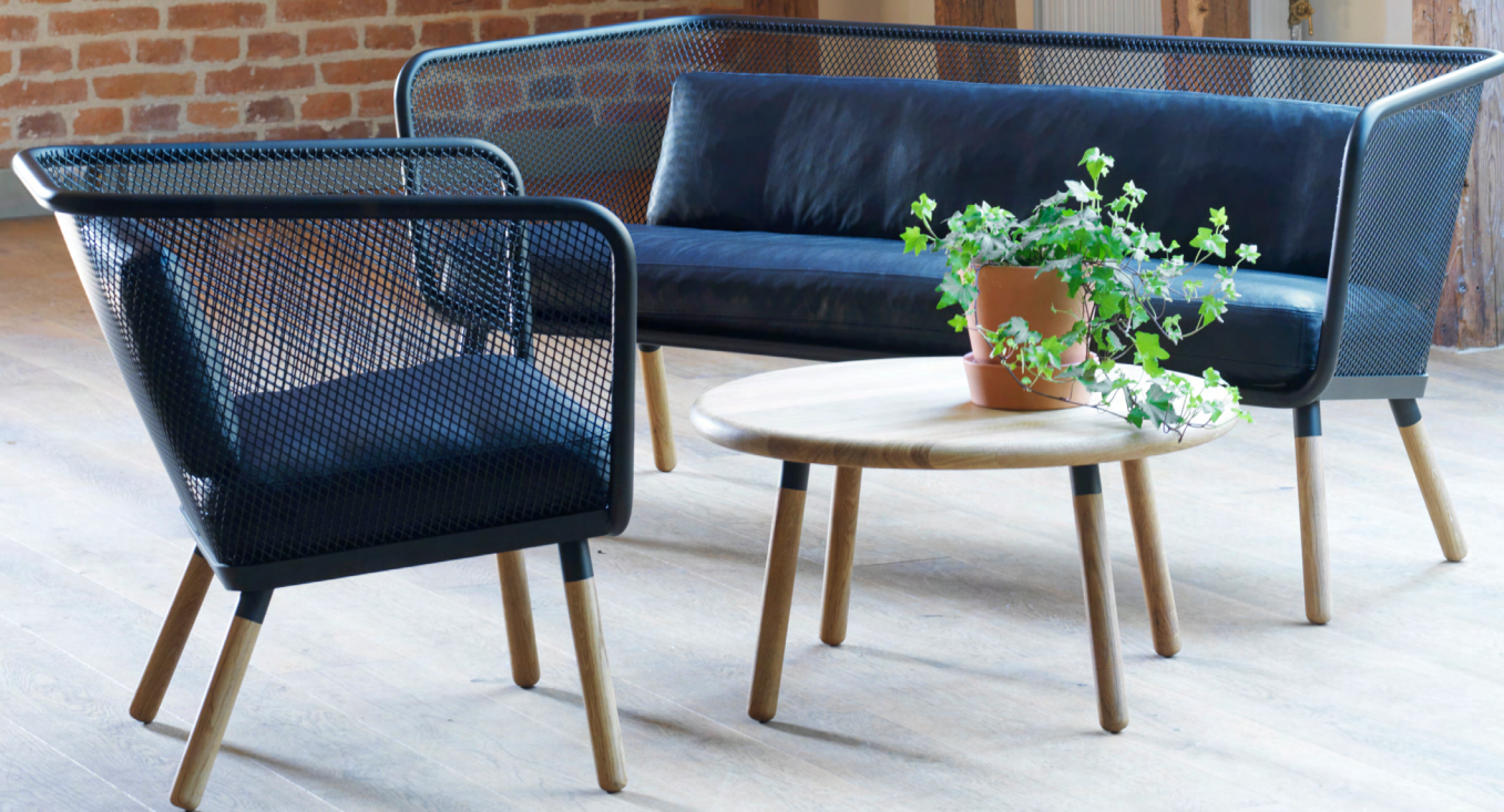
Honken S | Honken XL | Honken Table