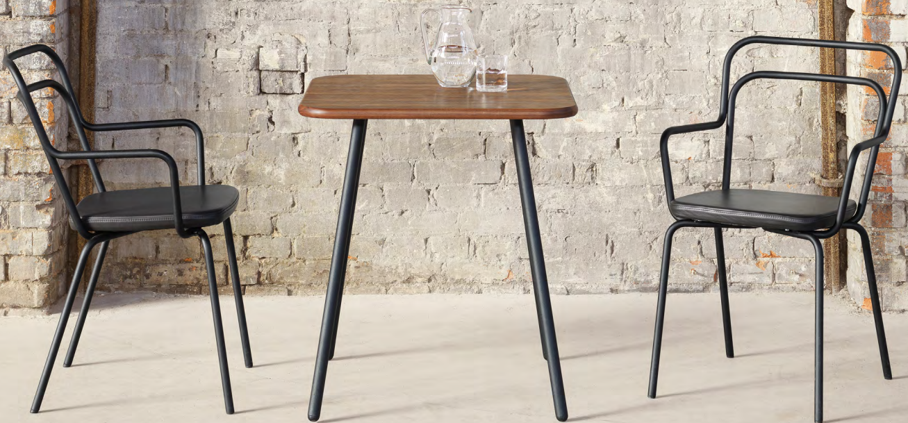
Kaffe | Kaffe Table