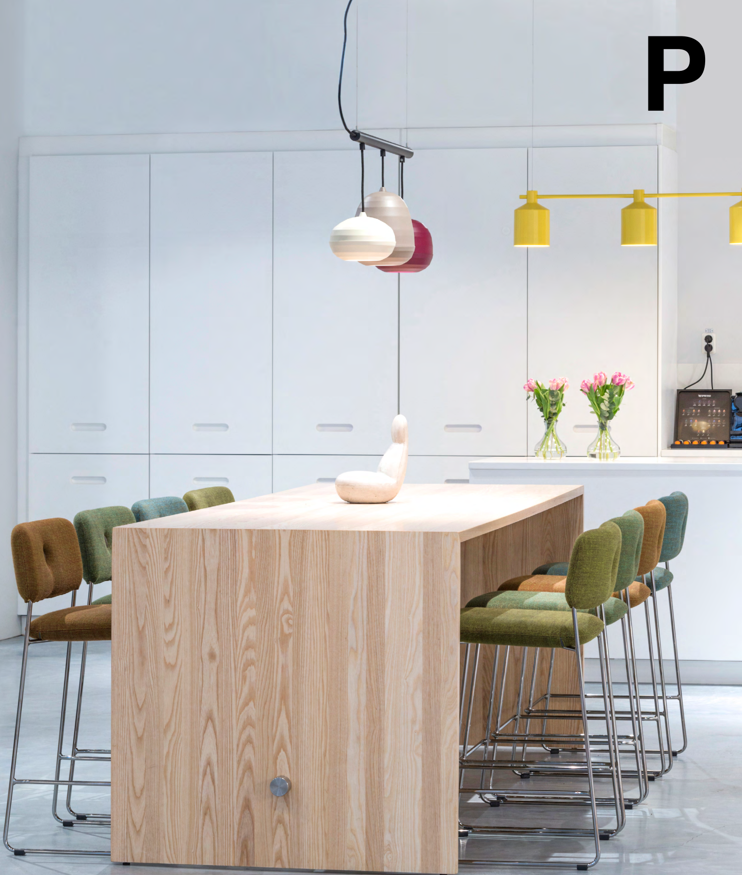
Ping-Pong Table | Dundra | Mini-Oppo